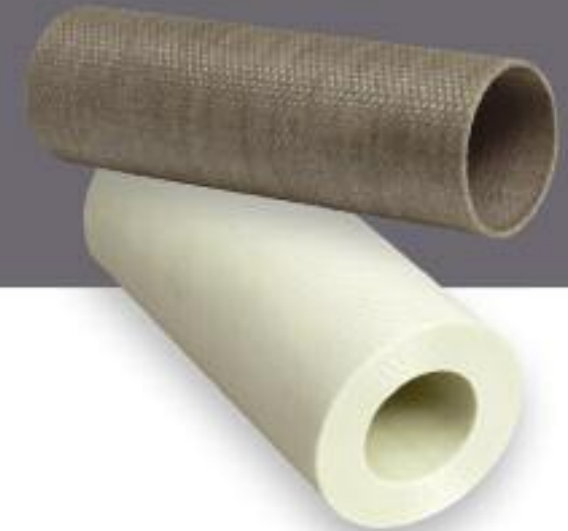
Braking components provide high reliability against impact forces and extreme temperatures during installation and use.

Heavy Industry: Various resin and substrate combinations allow thermal and mechanical performance to be tailored to specific heavy industrial applications. Unlike many thermoplastics, thermoset composites withstand high temperatures created by cutting tools without breaking down, burning or adhering to tool-cutting surfaces. Compared to metal options, thermosets often cost less and provide wear resistance and insulating features not offered by metal materials.