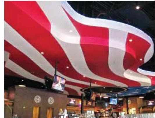
Restaurant/Ceiling Installation on Luster