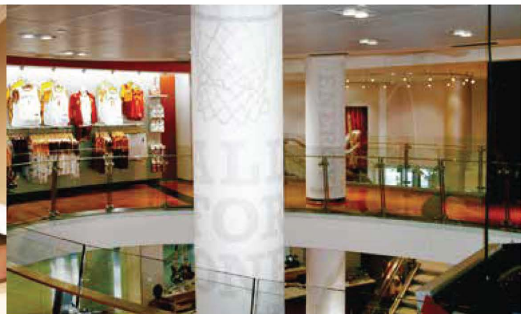
Retail/Columns, Soffits, & Wallcoverings on Suede