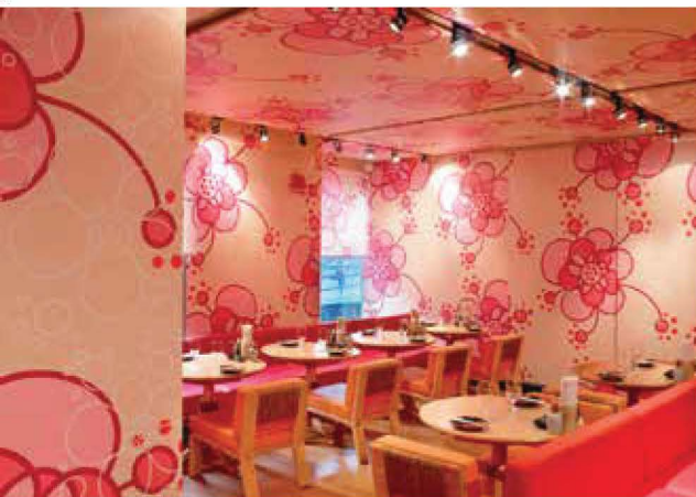
Restaurant/Wall & ceiling coverings on Artist Canvas