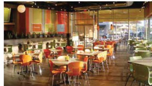
Restaurant Chain/Wallcoverings on Suede