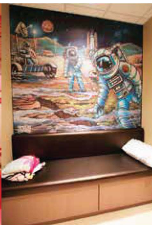
Office/Wallcovering on Mystical