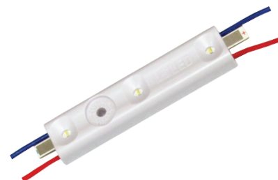
2 MODULES / FOOT