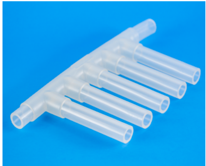
One-piece overmolded C-Flex manifold maintains inner bore diameters with superior reliability and product integrity.