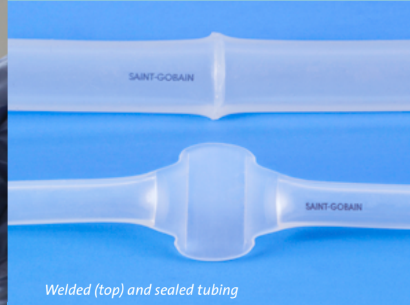
Welded (top) and sealed tubing