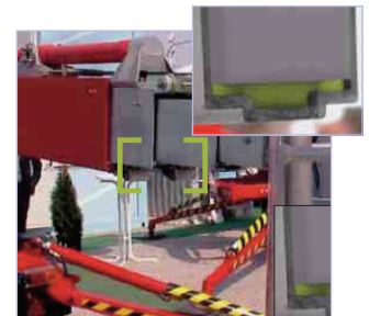
TIVAR® Ceram P® performs well as a slide panel in telescoping booms. Outstanding abrasion resistance adds to the wear-life of the pad.

* For higher load boom pads Quadrant has the broadest range of products, including materials like Nylatron® NSM and Nylatron® 703 XL that handle much higher load requirements.