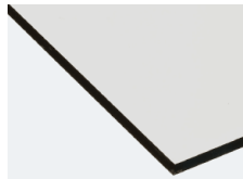
Metropolitan Manhattan Black