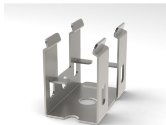
Mounting Clip: ILT-SHM30717P1

Specifications subject to change without notice.