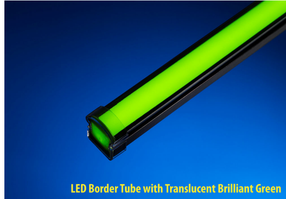
LED Border Tube with Translucent Brilliant Green